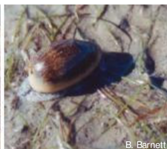
Life in intertidal seagrass meadows at Pallarenda: gastropods and heart urchin