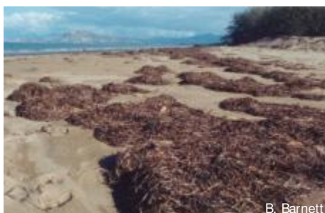
Seagrass washed up on Pallarenda beach

In recognition of the importance of seagrass meadows as a foraging habitat for dugongs, Cleveland Bay was declared a Dugong Protection Area in 1998. The use of mesh nets is restricted in this area. By law (QLD Fisheries Act 1994) it is prohibited to damage seagrass or any other marine plant. Activities that may cause damage to seagrass, for example, earthworks in tidal areas or on the shore, require a permit.