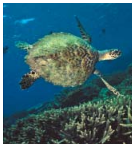
Research is unlocking the key to turtle health trends

It may also be a valuable indicator of the environmental status of the habitat.