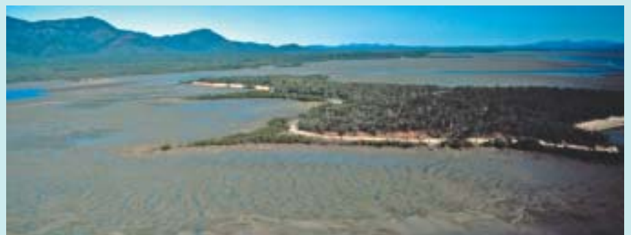
The report examines the quality of water entering the Marine Park

"The Reef Water Quality Protection Plan provides the framework for improving land management practices that effect water quality in the Reef catchment."