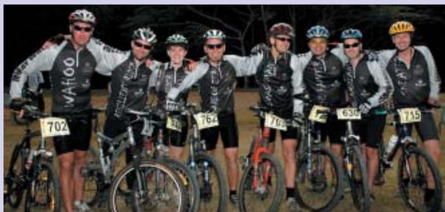
GBRMPA staff cycle for a good cause during the Paluma Push

Colleagues helped the bike riders raise $300 for the Rural Fire Brigades of Paluma and Waterfall Creek.