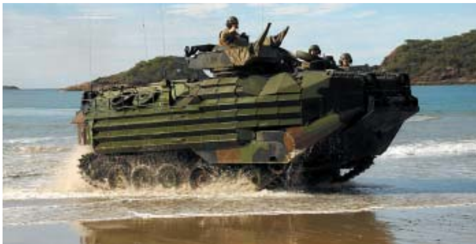
A US Marine Corps armoured amphibious vehicle during the training

"This involves a combination of consultation at local, state and national levels, using research and conducting an environmental impact assessment."