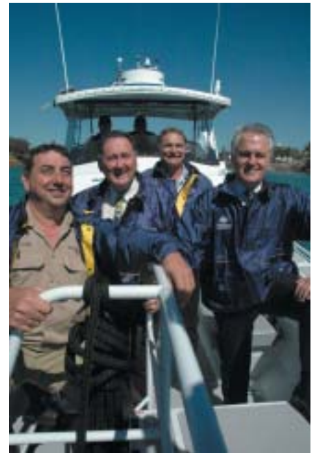
The Minister for the Environment and Water Resources launched the new boat in Townsville

Its 500 nautical mile range, high response speed and shallow draught makes it ideally suited for work in the north of the Marine Park.