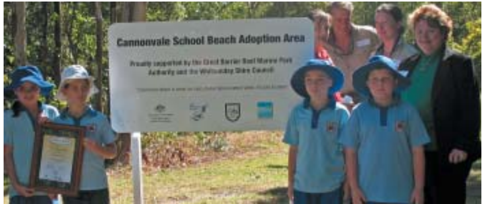
Students celebrate the beach adoption

"This is the first official Reef Guardian Schools beach adoption in conjunction with their local council.