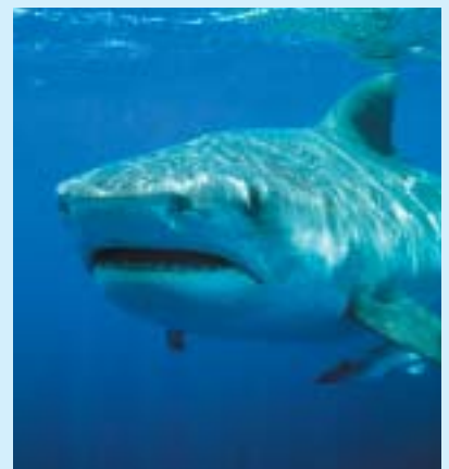
Tiger sharks were the stars of the community forum