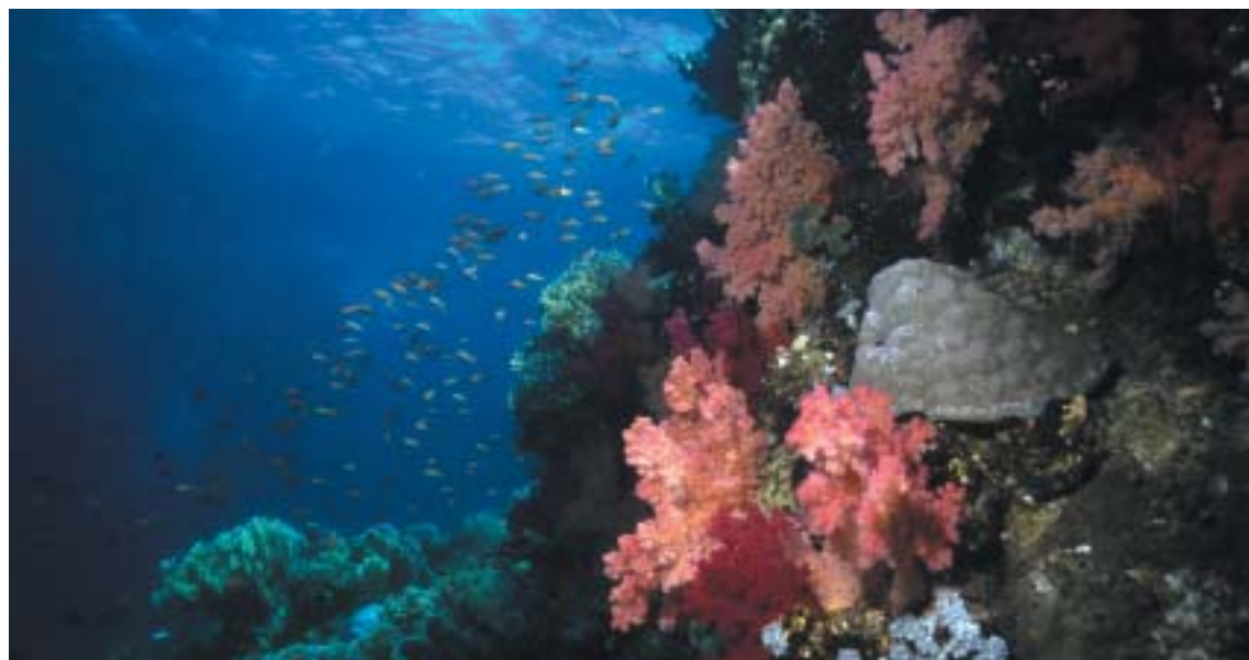
Councils have pledged their support to protecting our Great Barrier Reef

Councils along the Queensland coast have signed up for an innovative environmental programme that will help protect the Great Barrier Reef.