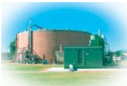
Biogas and Primary Digester

Treatment of wastewater at Cleveland Bay Wastewater Purification Plant is in accordance with standards set by the Department of Environment. Citiwater operates a Quality Management System that complies with the requirements of international standards ISO 9002. We also adopt a professional and best practice approach to manage Townsville's water and wastewater business. Citiwater is committed to evaluate alternatives to improve the water system in Townsville, and to reuse resources generated by the wastewater treatment such as effluent, gases and sludge. The advantages of reusing these resources benefit the community in many ways such as keeping our air clean and conserving the fresh clean water from the catchment, avoiding polluting our environment. Thus we are helping Australia to achieve sustainable development.