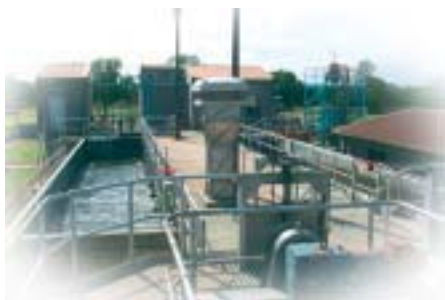
Aerated Grit Tanks

The removal of these solids not only helps treat the water but also prevents damage or blockage of the Treatment Plant downstream. The remaining wastewater, containing dissolved nutrients, organic matter, viruses and bacteria, flows to the Aerated Grit Tanks, where the water is aerated with diffused air. The consequence of bubbling air into the water helps to separate the remaining grit from the organic material. The grit falls to the bottom of the tank and settles in collection hoppers. Pumps are used to remove the grit from the hoppers which are then buried. The wastewater then flows to the Flow Distributor, which acts like a large pump, distributing wastewater and Activated Sludge around the Treatment Plant. From here water goes to the Secondary Treatment.