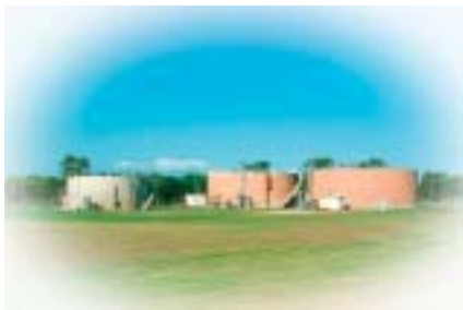
Sludge Digester Tanks

Because there is no air in it (anaerobic), the microbes use oxygen from other chemicals in the sludge such as sulphates, nitrates and phosphates, breaking down their composition. Sludge stays in the 2 Primary Digester Tanks for around 30-40 days, then is pumped to the Secondary Digester Tank for further digestion and dewatering.