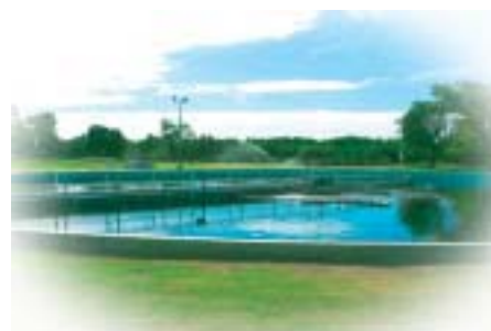
Clarifier Number 2

Around 10% of the sludge from the bottom of the Clarifier is pumped to the Primary Sludge Digester Tanks where it is further broken down. The